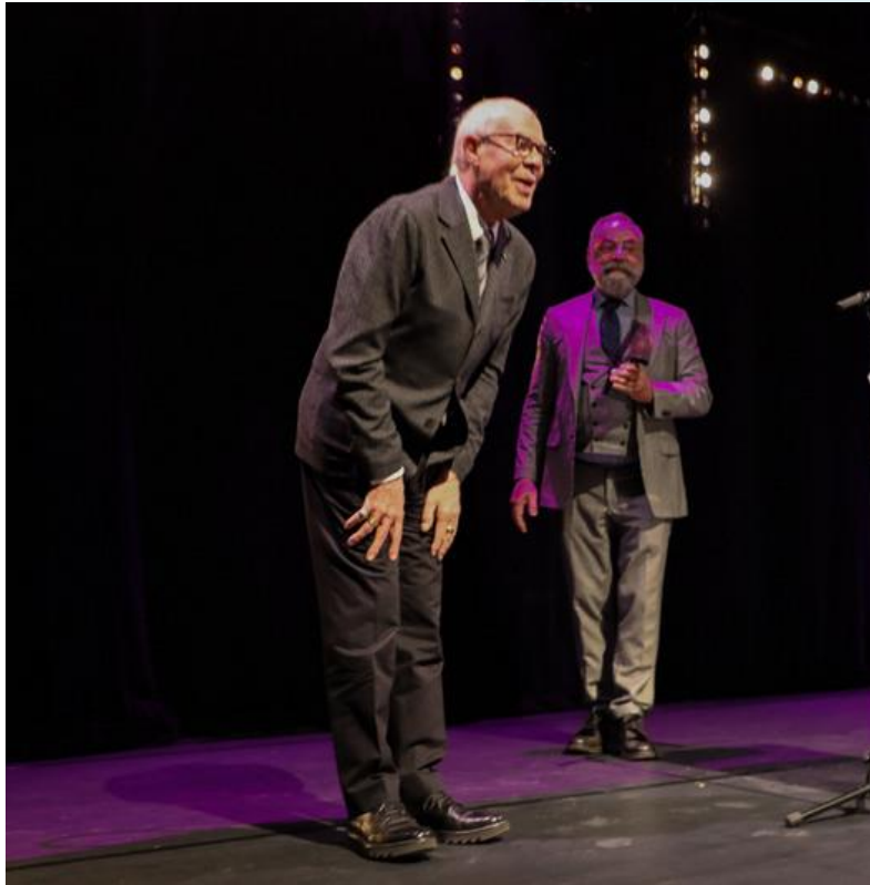
Hans van Manen and Oscar Hammerstein at the Dutch Dance Festival, 2017